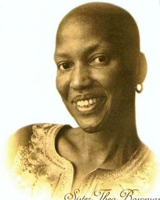
Sister Thea Bowman