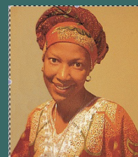
Sr. Thea Bowman