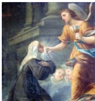
Tela di Angela da Foligno, Unknown painter

“Oh, yes!” answered the third girl, “That’s why we are part of the Cenacle. In the letters Angela wrote and which we read during our meetings, she showed how much she understands the human heart and how much she encourages people to follow the cross, live in true poverty, and humility of heart, and to